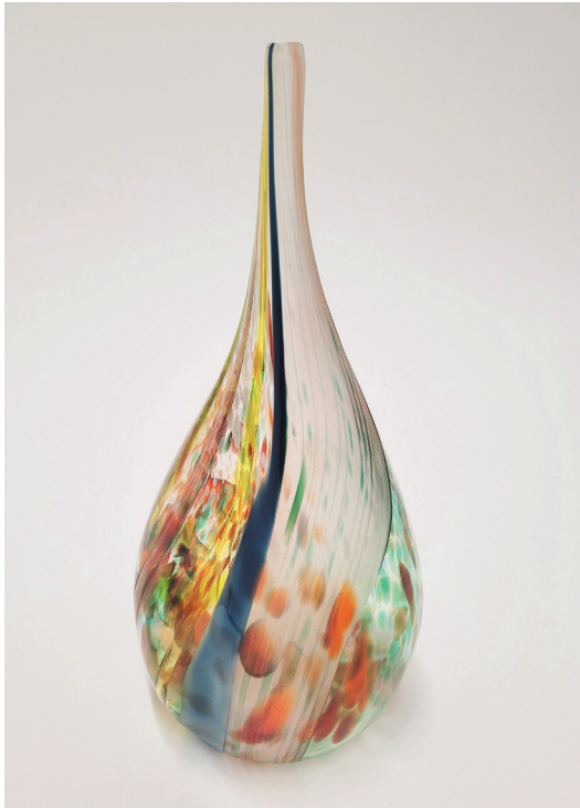
LEAH HENSELER "Quick!" Blown Glass