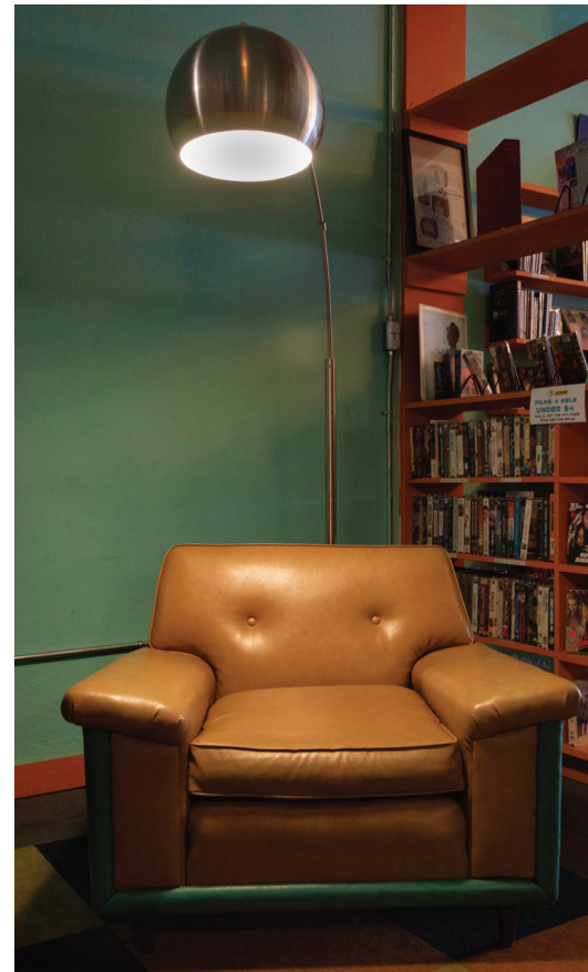
ADELLA OTT Journey of the Mind Digital Photography