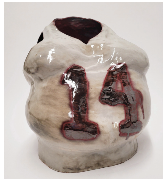
LUCAS VARNUM Jersey Ceramic