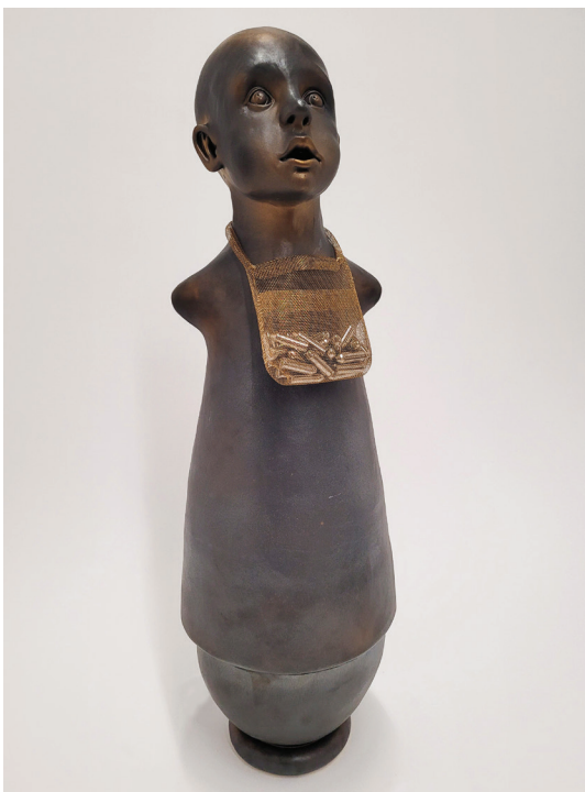
SEPIDEH KALANI Yummy! Ceramic and glaze